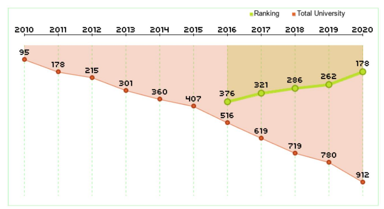
Figure 1. World ranking of Northeastern University [2]

Northeastern University joined UI Green Metric in 2016, and our performance in terms of sustainable development has improved constantly since then, as shown in Figure 1. Compared to other private universities in the region, we are ranked 1<sup>st</sup>. More information is available at the NEU Green University website [2].